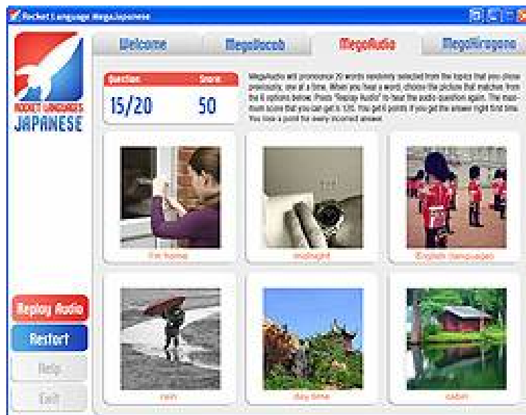
Screen shot of the Rocket Japanese audio comprehension learning game.

In the audio comprehension game, users play an audio clip of a word or phrase in the target language and select the corresponding word or phrase from six options displaying image and a translation.